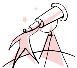
Reaching Our Potential

Occupational therapy is moving toward its centennial year. We have a tremendous amount to celebrate, however we must